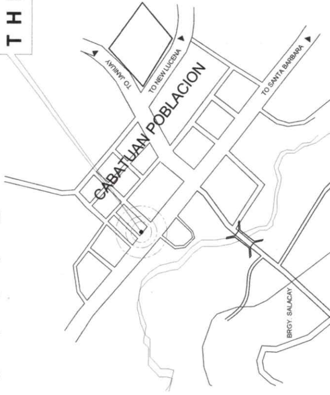
VICINITY MAP SCALE: _____ NTS.